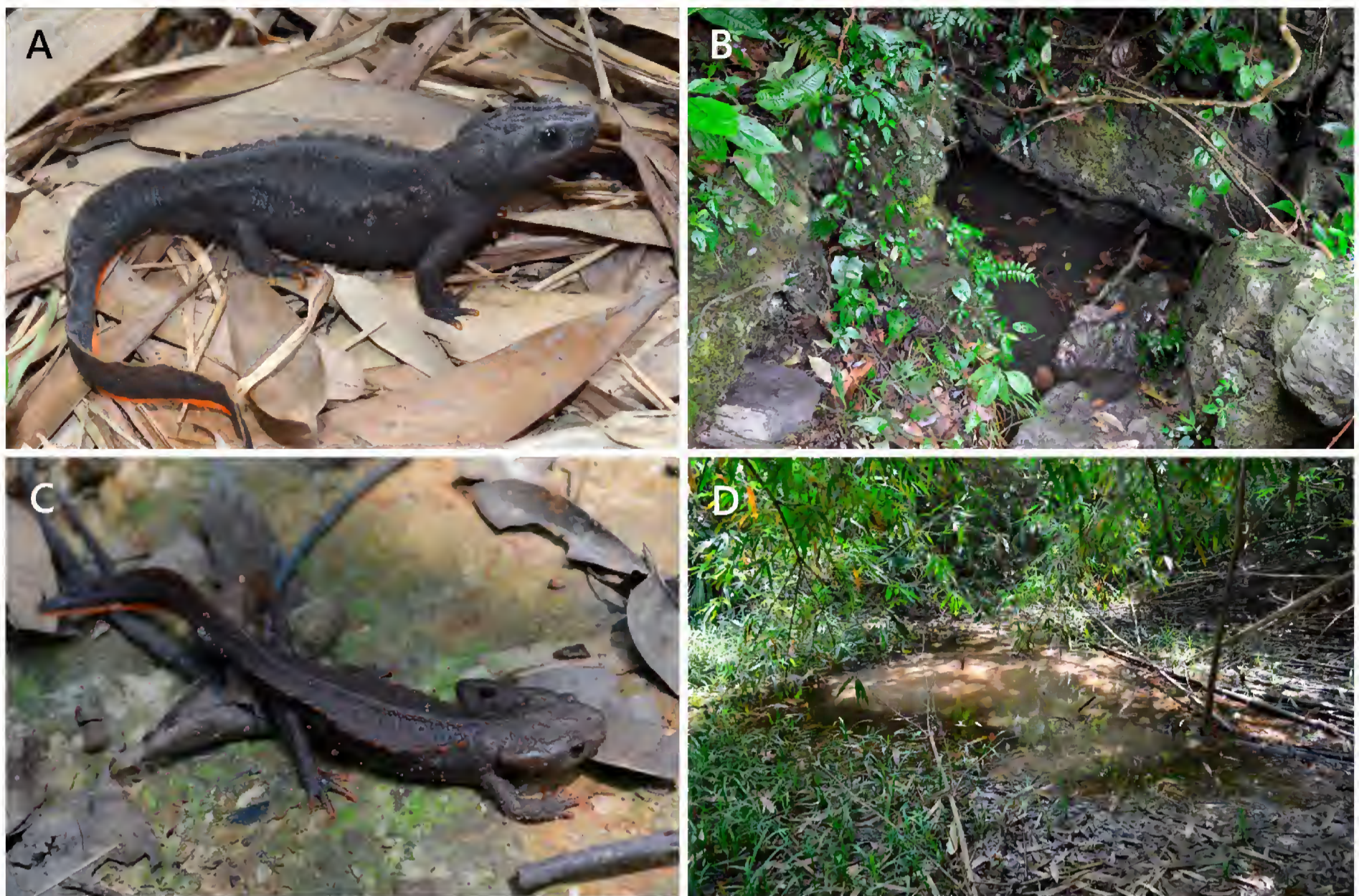
Fig. 1. A. Adult male of Tylototriton zieglerei ; B. Habitat type in Bao Lac district, Cao Bang Province; C. Adult male of Tylototriton vietnamensis ; D. Habitat type in Tay Yen Tu Nature Reserve, Bac Giang Province.

sus , and T. yangi (Khatiwada et al. 2015; Le et al. 2015; Nishikawa et al. 2014; Phimmachak et al. 2015; Yang et al. 2014).